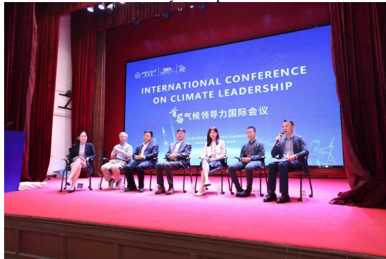
International Organisations Forum