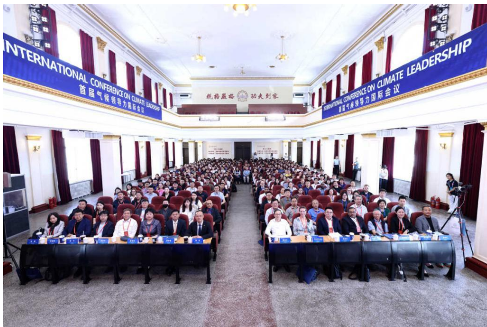
Opening Ceremony of the First International Conference on Climate Leadership

The First International Conference on Climate Leadership was held on 21–22 July 2025 at Harbin Institute of Technology. Organised by the Business School, Harbin Institute of Technology; the Bartlett School of Sustainable Construction, University College London; and the Chinese Economic Association UK/Europe, the inaugural conference brought together more than 200 experts and scholars from countries including China, the United Kingdom, Spain, and Australia, as well as representatives from international organisations and academic journals.